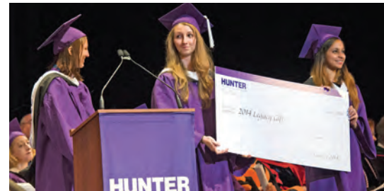
Students present the legacy gift at Commencement.

At Hunter, many of our students benefit from the generous contributions of our donors. We want our graduates to understand the importance of philanthropy and to give something back as they leave the College.