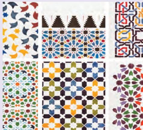
Detail from Alhambra Stencil Samples (2014)

In 2015, The Artist's Institute will move uptown to the newly renovated brownstone Casa Lally, at 132 East 65th Street, also the home of Hunter's Italian language institute, Parliamo Italiano. The new location will house a gallery, library and event space for the Institute.