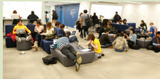
New kids in the Bloch

The Bloch Commons is designed for them—and for all Hunter students. “Most colleges have a commons,” Bloch points out. “Hunter, being a commuter school, didn’t. So that’s what we decided to do. My parents were part of the City