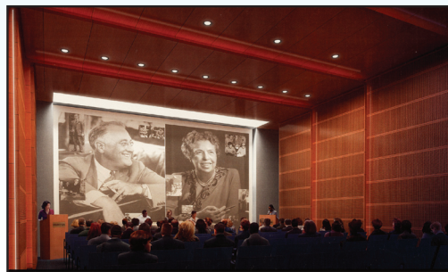
Digital rendering of the Roosevelt House Auditorium

We hope you will join us in celebrating this historic reopening and become involved in one of the most exciting new ventures in our community. To learn more about Roosevelt House, please visit roosevelthouse.hunter.cuny.edu .