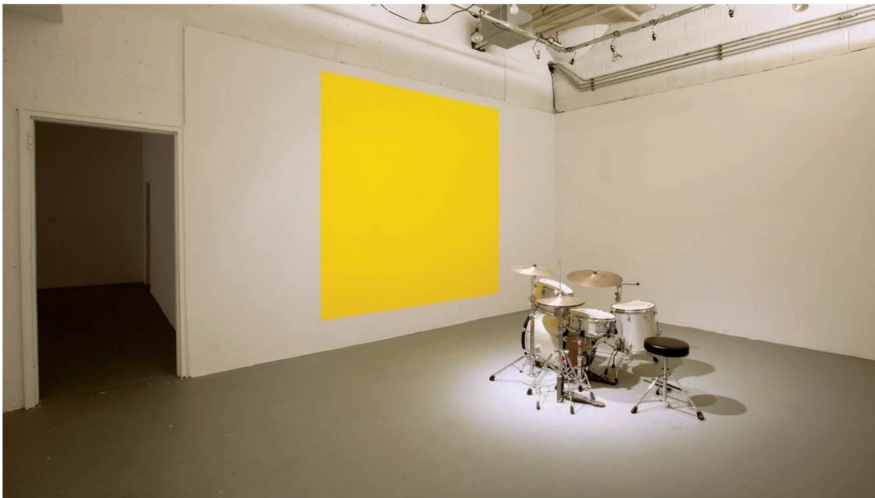
Above: Lynne Harlow, BEAT , 2007, acrylic paint, drum kit, live performance with musicians. Installation view.