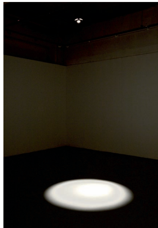
Above: David Lamelas, Limit of a Projection I , 1967, theater spotlight in darkened room. Installation view.