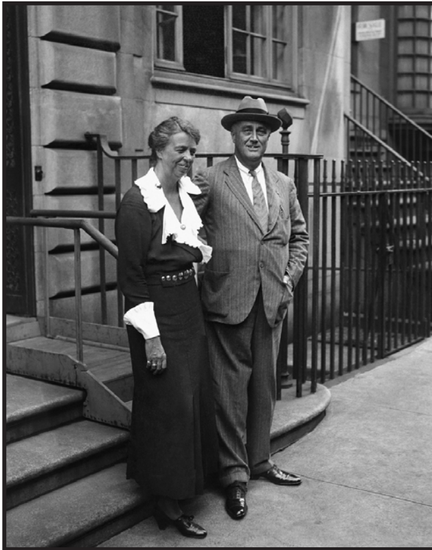
Eleanor Roosevelt and Franklin Delano Roosevelt pose outside the house, September 1933.

Re-opened in 2010, the Roosevelt House Public Policy Institute continues to honor the distinguished legacy of Franklin and Eleanor Roosevelt. Our mission is to educate students in public policy and human rights and to promote creative dialogue through seminars, exhibits, conferences, and public programs.